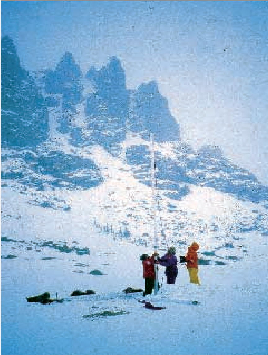
Fig. 2: A lightweight percussion coring system designed for remote access being used to recover a continuous 14,000-year lake sediment record from Sky Pond (3320 m asl) in the Colorado Front Range. The Sky Pond record provides the first clear indication that changes in late-glacial and early Holocene vegetation near timberline in the Rocky Mountains were in phase with the Younger Dryas climatic oscillation in the North Atlantic region. Additional paleo records from climatically sensitive high elevation sites are required from mountain regions around the world to complete the picture of regional paleoenvironmental changes.

terrestrial sites. Mountain regions provide excellent opportunities for the acquisition of such information.