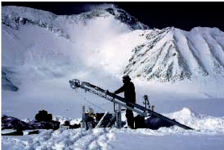
Fig. 1: The Eclipse ice core drill at 6500 m on the Far East Rongbuk Glacier with Mt. Everest in the background.

3 Lanzhou Institute of Glaciology and Geocryology, Academia Sinica, Lanzhou, China, kangsc@lzu.edu.cn