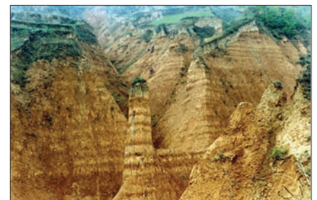
Figure 1: Field photo showing the alternation of loess (yellow layers) and paleosols (red-brown layers) in Miocene loess-soil sequences from the Chinese Loess Plateau, Gansu Province.

The impact of the uplift of the Tibetan Plateau (TP) and the Rockies (RC) on Asian summer and winter monsoon climate was investigated, using both data and models for the last tens of million of years. Using the Meteorological Research Institute-coupled general circulation model, T. Yasunari