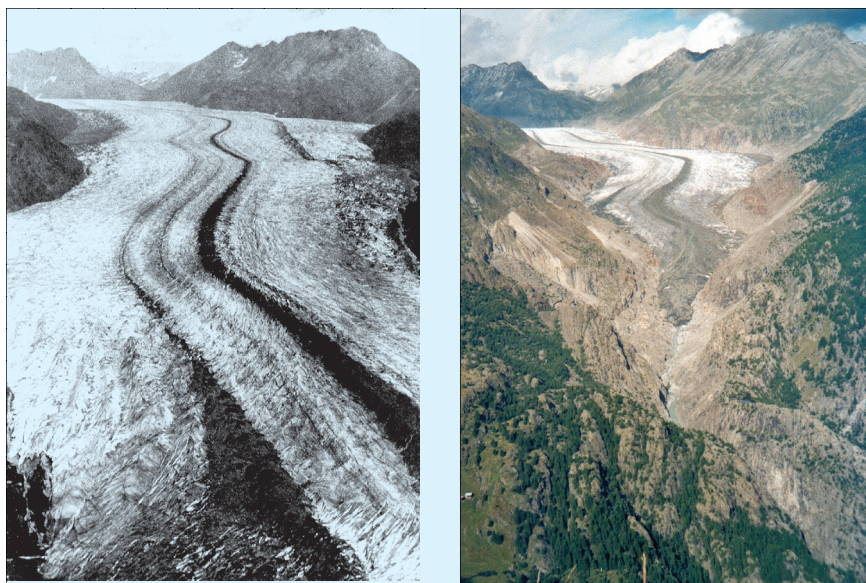
Fig. 1: The Great Aletsch Glacier seen from Belalp around 1856 and in 2001 (Photographs taken by Frédéric Martens, Alpine Club London, and Hanspeter Holzhauser).

Volume and mass changes of mountain glaciers represent key variables within global climate monitoring programmes, especially with respect to strategies for early detection of an enhanced greenhouse effect (Haeberli et al., 2000). Such strategies require quantitative information on both current and past rates of change. Overall energy fluxes associated with annual changes in ice thickness can be estimated based on a latent heat content of 3.338 \times 10^5 J/kg. Thus, an annual change in ice thickness of 0.1 meters roughly corresponds to an additional energy flux of 1 \text{ W/m}^2 irrespective of the details of the complex energy exchange processes involved. Direct determination of glacier mass changes began with the advent of modern cartography and repeated mapping of a few glaciers in the Alps at the end of the past century. In most regions of the world quantitative information became available only much later. Information on pre-industrial mass changes of mountain glaciers must