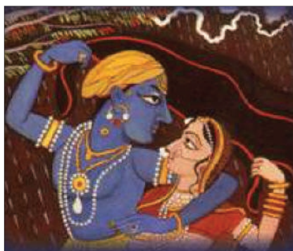
Fig. 1: Indian miniature showing a male Monsoon donating rain and fertility, as a symbol of life and love, to a voluptuous woman.