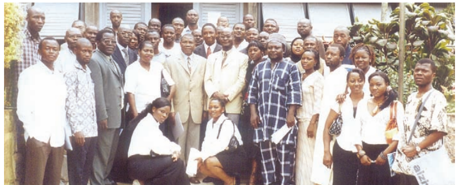
Figure 2: Participants of the first Central African PAGES Workshop.

This was followed by a session on instrumental climatic records. The second day was composed of a chain of presentations ranging from Holocene paleoclimates to recent ecosystems and human interactions, and concluding with past natural and human-induced disasters in the region. Some interesting findings presented on this day included a most remarkable drop in rainfall in the region, over the second half of the 20th century. Even Debuncha (at the foot of Mt Cameroon), which used to be the second wettest place in the world with over 12 m/year in the 1960's, has witnessed a drop to less than 10 m/year today. Research using proxy data from lake sediment cores, fossil dunes, river terraces and stalagmites was also presented. These were used to assess climate variability across a range of temporal scales (Holocene, Quaternary, and last millennium to present). Paleoclimatic reconstructions suggested a humid phase for the first half of the Holocene in Central Africa, while a dry phase was evident between 5-4 kyr BP for the Lake Chad and Adamawa regions. In the south of this region, the dry phase seems to come much later (2.8-1.3 kyr BP) after which a humid phase would have persisted till today. Multi-spectral remote-sensing data was also presented and showed that deforestation and fuel wood-gathering (in the savannah-Sahel),