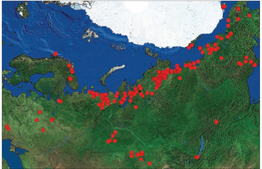
Figure 1. Location of sites entered in the database.

The workshop (which was partly funded by PAGES) included nineteen invited scientists, nine of whom are FSU nationals. Over a four-day period, the database was populated with data from 237 new sites with in-