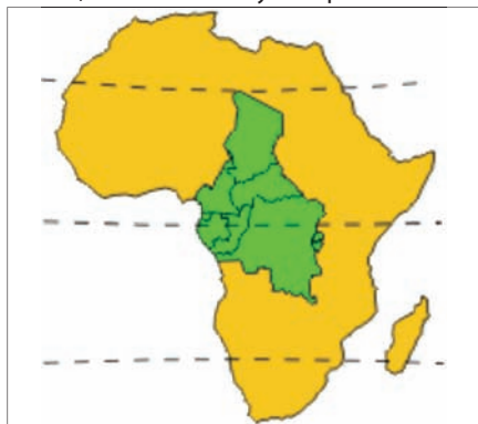
Figure 1: Map showing area of workshop focus.

The first day focused on opening activities, lectures and keynote presentations.