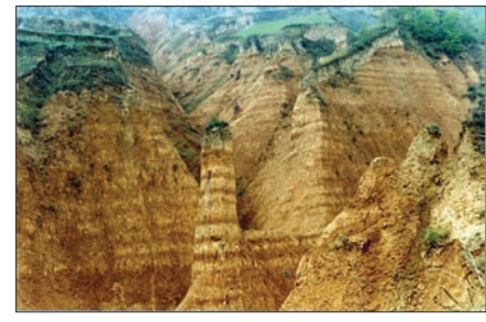
Figure 1: Field photo showing the alternation of loess (yellow layers) and paleosols (red-brown layers) in Miocene loess-soil sequences from the Chinese Loess Plateau, Gansu Province.

The impact of the uplift of the Tibetan Plateau (TP) and the Rockies (RC) on Asian summer and winter monsoon climate was investigated, using both data and models for the last tens of million of years. Using the Meteorological Research Institue-coupled general circulation model, T. Yasunari