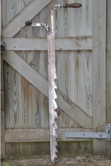
Figure 1: Stainless-steel peat-cutter, showing safety-sheath (left) and field use (center); its sharp edge (right) ensures a clean cut, and minimal environmental damage.