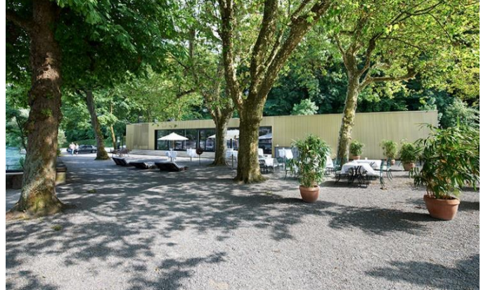
(3) Schwellenmätteli event room