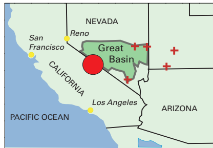
Fig. 1: Location map showing the position of Methuselah Grove (red circle), the other five lower forest border, moisture sensitive long chronologies (red plus signs), and the boundary of Nevada Division 3 (heavyline).

Almost fifty years ago, Edmund Schulman (1956) recognized the unique longevity of the bristlecone pines ( Pinus longaeva ) of the White Mountains on the border between California and Nevada. Alerce ( Fitzroya cupressoides ) in south-central Chile is the only other tree species to even approach the 5,000-year lifespan of the bristlecone pine. Even after death, the pines may remain standing for millennia, and their tight-ringed, resinous wood may survive several thousand years after falling to the ground. The persistence of this wood results from the combination of its properties with the cool, dry conditions that exist for much of the year at elevations of 2,800 – 3,400 meters in the severe rain shadow of the Sierra Nevada. In Methuselah Walk (Fig. 1 and cover photograph), many hundreds of