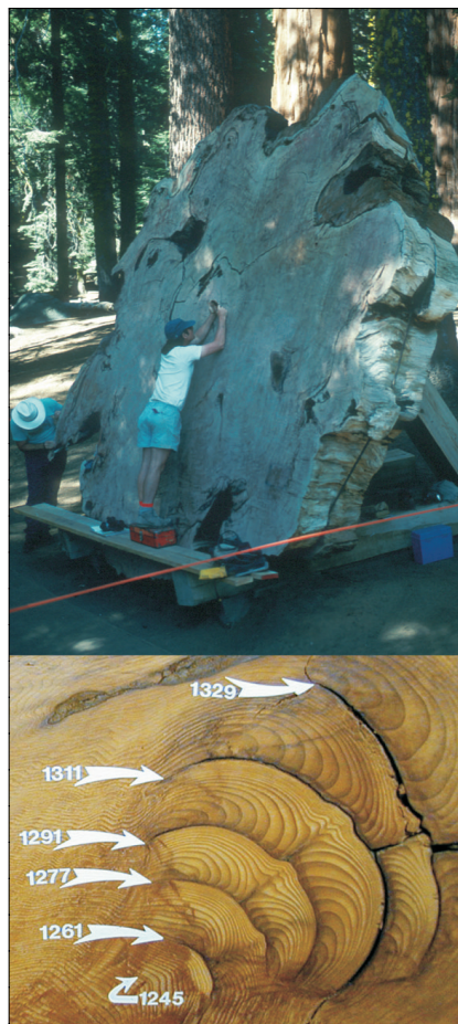
Fig. 1: Fire scars are created on the lower boles of trees by surface fires that injure the growing tissue beneath the bark (cambium), but do not kill the tree. Giant sequoias in the Sierra Nevada, California were repeatedly scarred by surface fires over the past three millennia (Swetnam 1993). By examining cross sections from dead trees, such as the one in the upper photo at Sequoia National Park, we can clearly identify fire scars within the ring sequences (lower photo), and date these fires to the year and season of occurrence. This particular tree had an innermost ring date of 256 BC, and contained more than 80 different fire-scar dates. Composites of fire-scar chronologies from individual trees, and from forest stands, provide time series reflecting fire occurrence and extent across a range of spatial scales.

In combination with calibrated precipitation and temperature reconstructions from tree rings, fire-scar networks help improve our understanding of ecologically-effective climatic change. These records can assist in identifying important changes in regional to global climate patterns, and they can be useful in developing models for forecasting fire hazards in advance of fire seasons. In this brief note I review examples of findings from fire-scar