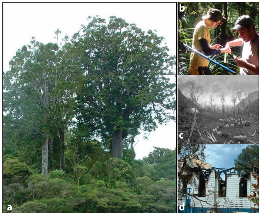
Figure 1: Sources of kauri material. Tree-ring chronologies for the last 500 years have been developed from: a,b living trees; c a few logging relics; and d,e from colonial-era building timbers.

In the growing season, Kauri growth is enhanced by cool-dry conditions, yet suppressed by warm-wet conditions, particularly in the austral spring (Sep-Oct-Nov; SON). This relationship to climate is fortuitous in terms of El Niño Southern Oscilla-