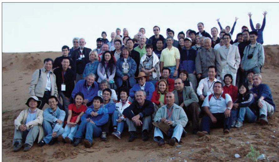
Figure 1: Workshop participants enjoying the sand dunes on the mid-conference field trip. The workshop also included two optional field trips to active and stable dunes in Inner Mongolia.

What became increasingly evident over the course of the workshop was the degree of difference between paleoclimate reconstructions from different regions. New dating indicates that dune sand accumulation in South Australia continued