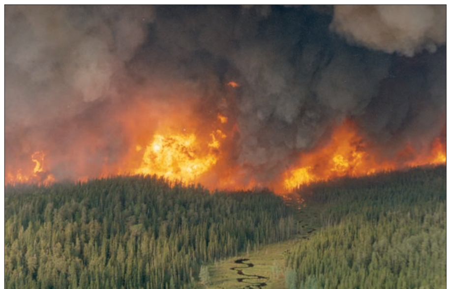
Figure 1: Red Lake forest fire, Ontario (photo by Brian Stocks, Canadian Forest Service).

high degree of data homogeneity over the observation period, 1959 to 1998. These large fires account for 97% of the total area burnt in Canada. The variable “FireOcc” represents the number of large fires per year. To broaden the temporal coverage of the study, we extended the FireOcc period