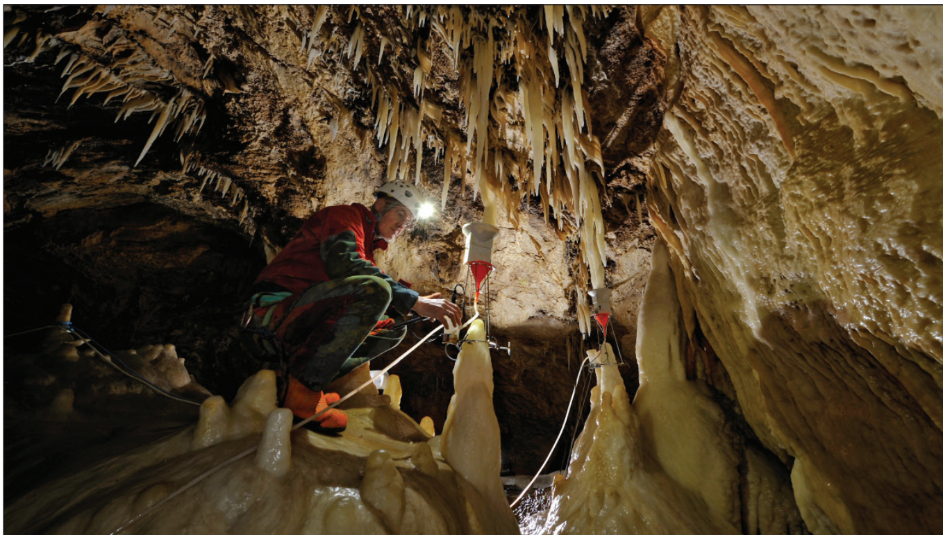
Figure 1: Dripwater collection in Obir Cave, Austria.