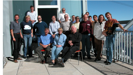
Drillers meeting Sep. 2004, Zugspitze, D

Core handling, transport and storage: The physical properties of cores change fundamentally when it is stored at warm temperatures. For the different properties, such as electrical, elastic and structural properties, procedures for handling and storage should be standardized and the temperature history of the core should be carefully documented. The aim is to have a history of handling for each core after it has been taken from the ice sheet. Projects should be encouraged to use temperature loggers for each step of the process and provide “certified samples”.